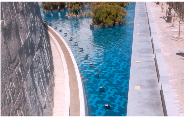
Alexandria Bibliotheca, Alexandria, Egy