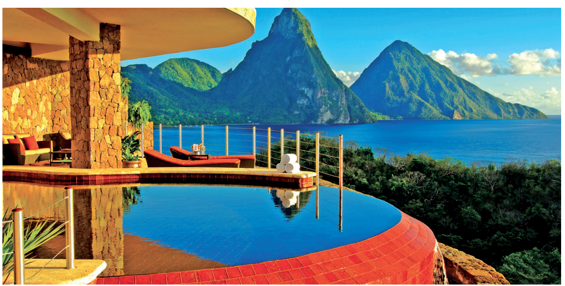
Jade Mountain, Anse Chastenet Resort, Castries, St. Lucia