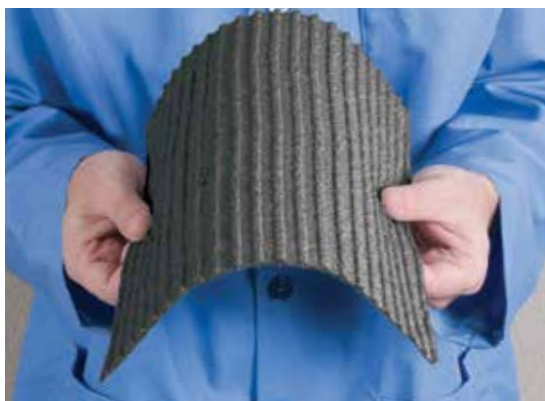
So flexible, a cured piece can bend without breaking!