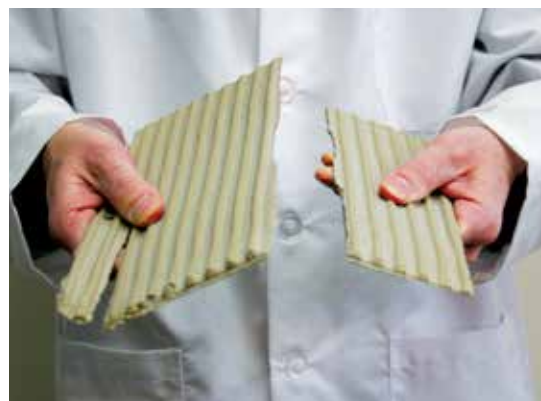
Traditional thin-set adhesives offer no flexibility.