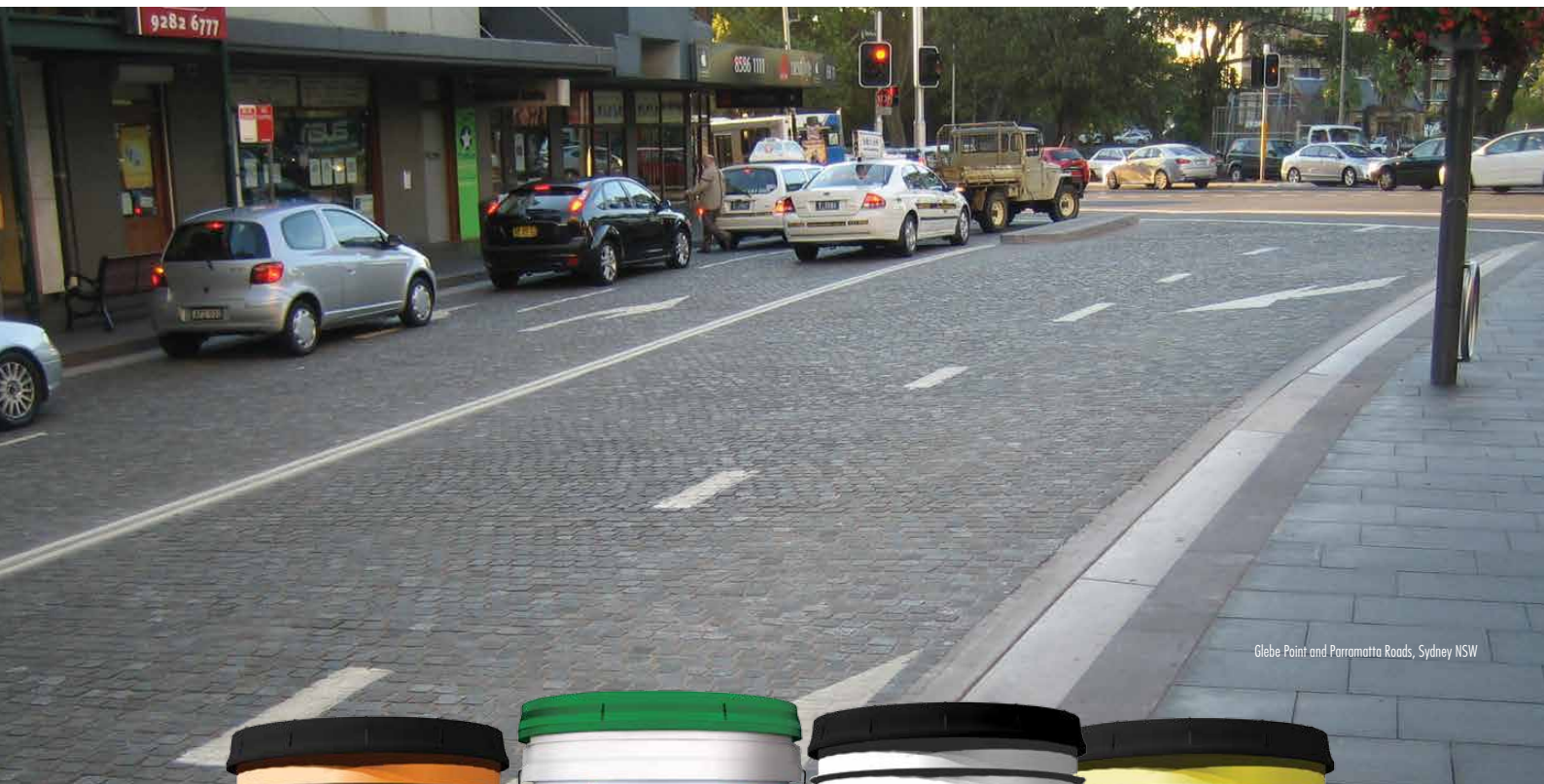
Glebe Point and Parramatta Roads, Sydney NSW