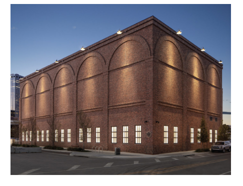
BUILDER: Creative Contractors. ARCHITECT: Baker Barrios Architects. CONTRACTOR: Masonry Builders Inc.