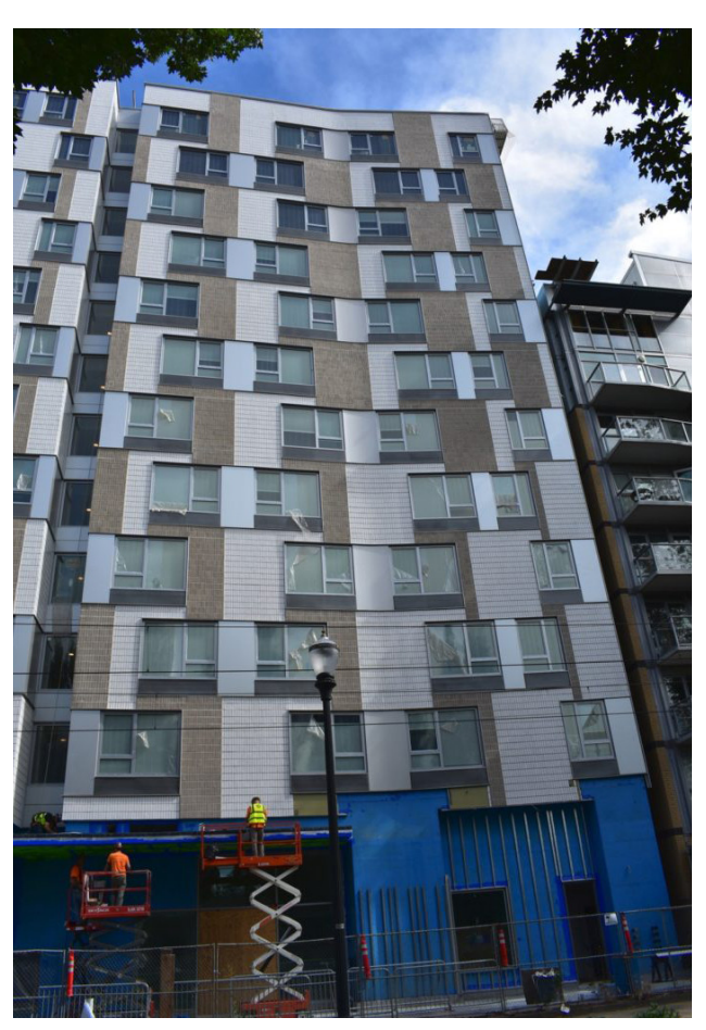
Project: Louisa Flowers Building, USA