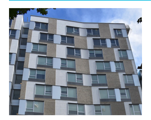
LOCATION: Portland, Oregon, USA. ARCHITECT: LEVER Architecture & LRS Architects. BUILDER: O'Neil Walsh Community Builders.