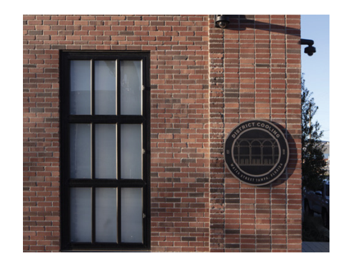
DISTRIBUTOR: FSS Company. MATERIAL SUPPLIER: Marion Ceramics.