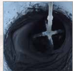
Mix and then grout