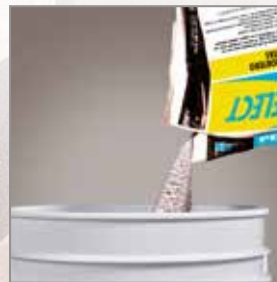
Add base powder