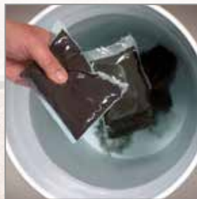
Drop packs into water