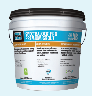
Data Sheet DS-1191