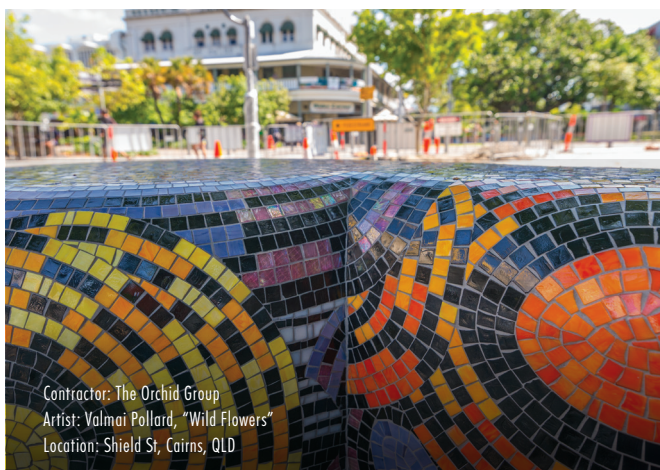
Contractor: The Orchid Group Artist: Valmai Pollard, "Wild Flowers" Location: Shield St, Cairns, QLD

254胶粘剂是一款可以快速安装的聚合物强增强型的产品，适用于室内外瓷砖、薄瓷、石材、路面砖等的安装，与水混合即可使用，具有开放时间长、粘接力优异和施工性能好等优点。此款产品可与雷帝多彩填缝剂颜料包混合，实现彩色胶粘剂。