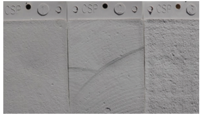
CSP1 to CSP3

有色胶粘剂，一包20kg的254（仅白色）与2盒（4个单独的颜料袋）雷帝多彩填缝剂颜料包混合。使用前，检查以确保颜色与填缝剂颜色匹配并可接受。