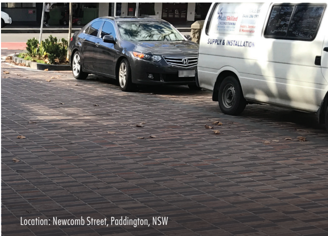
Location: Newcomb Street, Paddington, NSW