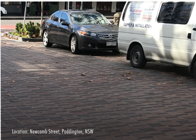
Location: Newcomb Street, Paddington, NSW