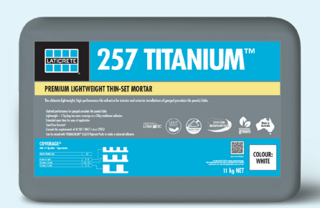
Product Data Sheet DS 1278