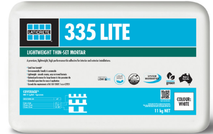
Product Data Sheet DS 1275