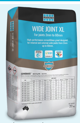
Product Data Sheet DS 1285