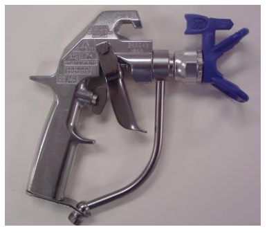
Silver Gun Plus

Follow the specific airless sprayer and spray gun manufacturer's written instructions when using their specific equipment. The Graco Silver Gun Plus® is depicted in the following photo. This spray gun can be used for both vertical and horizontal applications. Some Spray Guns will allow filtering in the gun handle. The filters will need to be periodically cleaned and changed to ensure proper liquid flow through the spray gun and tip.