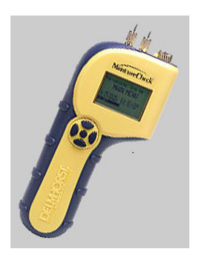
Figure 1.1 — (Clockwise from top left) ASTM F1869 Calcium Chloride Test Kit, ASTM F2170 Relative Humidity Meter, ASTM F2420 Insulated Hood with probe attached, and ASTM F2170 Pin Type Moisture Meter

Concrete contains moisture from the day it is poured and a generally accepted minimum cure time of 28 days is required before a finish material is applied. It may be important to note that 28 days is not a magic number that relates directly to every concrete installation. Simply relying on 28 days can be insufficient and can lead to failure of materials which may be affected by high moisture levels. The cure time of the concrete can vary depending on;