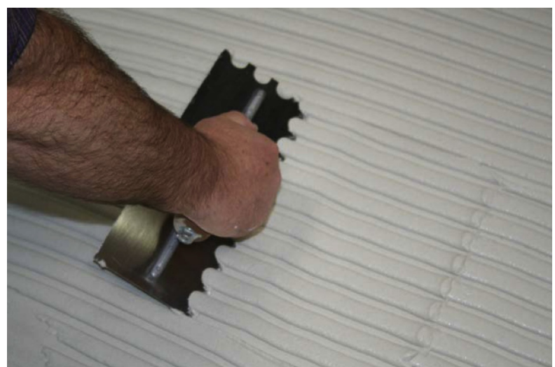
Picture 1.2 — 18 mm loop notch trowel with a medium bed adhesive used for large format tiles or stones. Trowel thin set adhesive in one direction holding trowel at a 45 degree angle. Notice the full ribbons of adhesive that left behind.

Complete bedding of the tile with the appropriate adhesive is another area that requires attention. Lack of thin set adhesive coverage can lead to cracked tile and grout and loss of bond to the tiles. Use the appropriate sized notch trowels (see picture 1.2) troweling technique and tap or twist the tiles in place to properly bed the tiles. Large format tiles should be back notch troweled with additional thin set adhesive to ensure that the appropriate coverage is achieved. Notice the lack of coverage in picture 1.3. To correct these errors, carefully remove the grout around the perimeter of the loose tiles and any hardened thin set adhesive so as to not disturb any tiles that are still well bonded and then replace using the appropriate troweling technique.