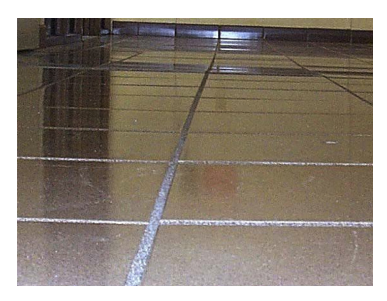
Picture 1-1 − Large format tile highlight imperfections in the substrate.

Since the ceramic or stone tile or slab facial dimensions are becoming much larger, the facial dimension tolerances are increasing. This can present problems when attempting to maintain tight joints. The joint width can be only as tight as the actual facial dimension range of the tile. In many cases, even rectified tiles (tiles that are calibrated to a tighter tolerance) will require a grout joint to be at least 4.5 mm in width depending on the size. Non-rectified tiles may necessitate a wider minimum grout joint width.