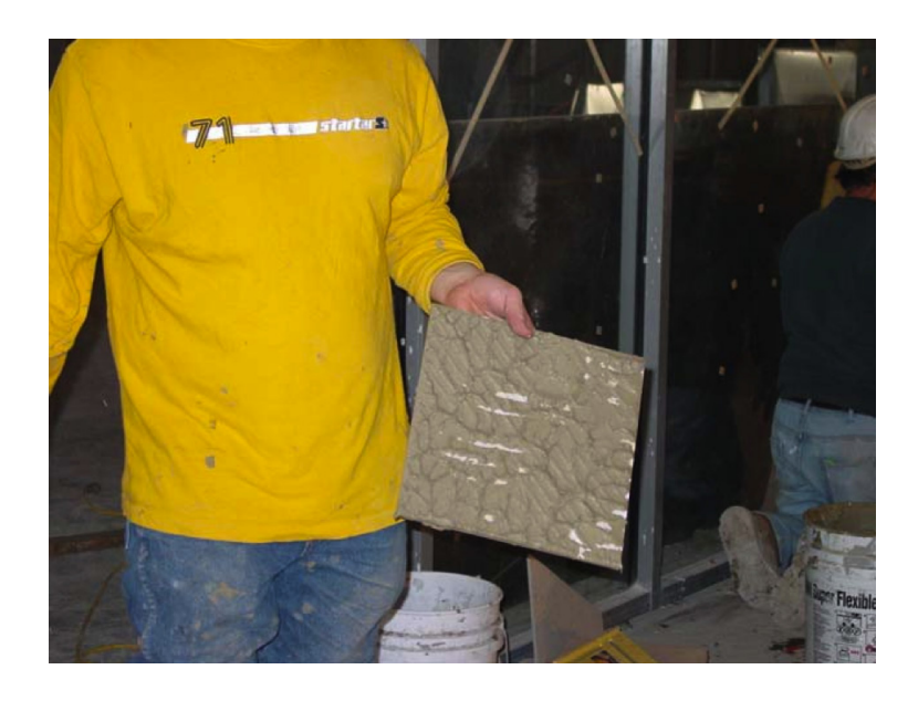
Picture 1.4 — Ceramic tile removed during the installation to verify proper coverage is being attained. Notice the lower right hand corner of the tile is lacking coverage. This will undoubtedly lead to a cracked tile.

Size of the tile will also determine exactly what tools are required to properly bed the tile. The simple logic is that the larger the tile, the larger the notch trowel size must be. A 6 mm \times 6 mm square notch trowel might be fine for a 108 mm \times 108 mm tile; it will not be suitable for installation of 500 mm \times 500 mm tile. It is important that this be understood, and that the installer pulls tiles up after they are installed to make sure that the desired coverage is achieved and that the surface of the tile installation is flat and true. Industry standards require that a minimum coverage of 80% be attained for interior, non-wet areas, and a minimum coverage of 90% be attained for any interior, wet area or any exterior installation. There have been significant advances made in trowel technology over the past few years that help make the installer's job easier. General guidelines for trowel/tile size are;