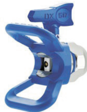
Typical LTX Sprayer Nozzle

The use of spray tip with a smaller orifice will result in less product being delivered to the substrate requiring multiple passes to ensure a complete coating with optimum thickness.