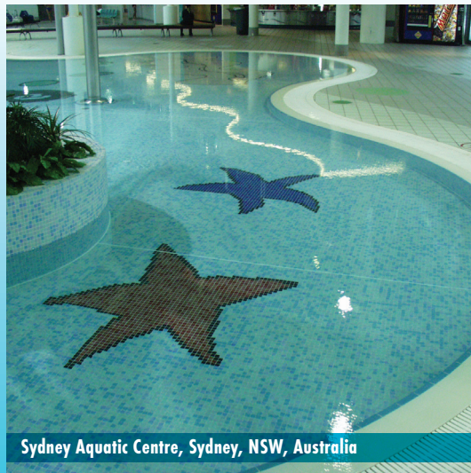
Sydney Aquatic Centre, Sydney, NSW, Australia