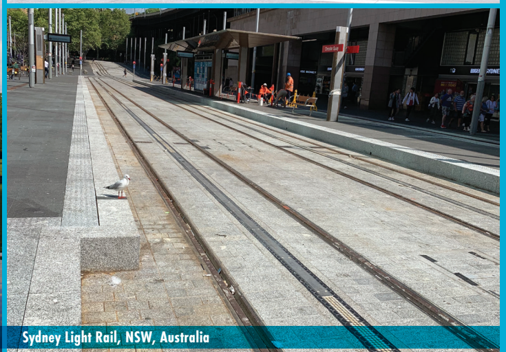
Sydney Light Rail, NSW, Australia