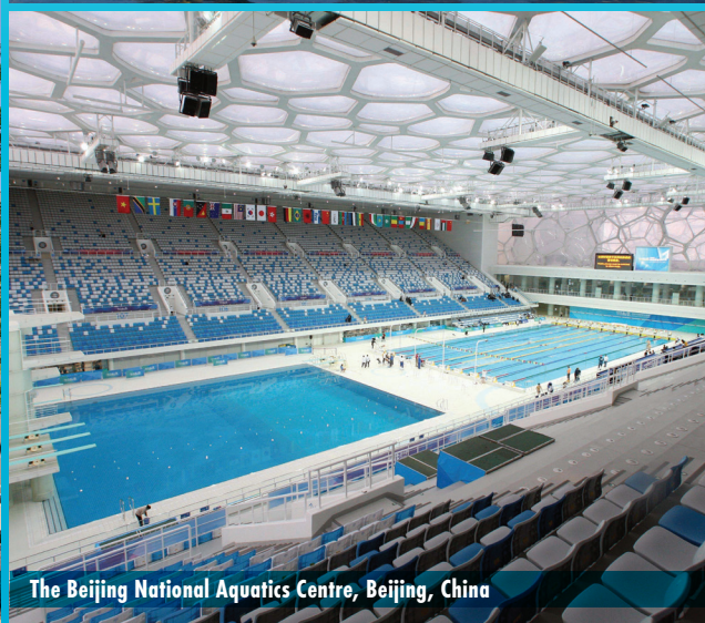
The Beijing National Aquatics Centre, Beijing, China

Worldwide Availability ■ Industry Standard ■ Code Approved System Warranty ■ On Site Technical Assistance