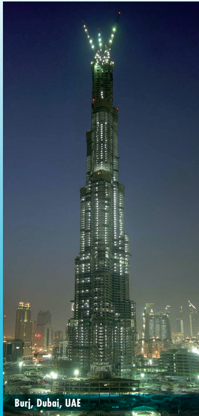
Burj, Dubai, UAE