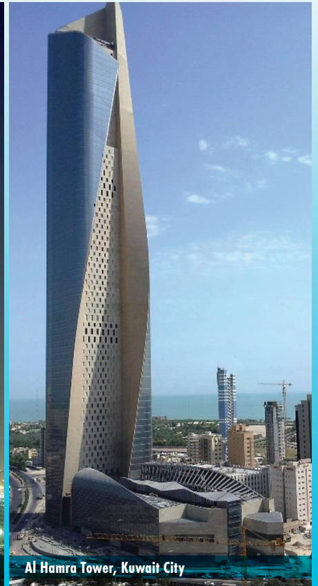
Al Hamra Tower, Kuwait City