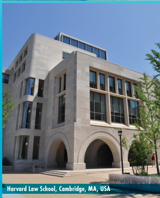
Harvard Law School, Cambridge, MA, USA