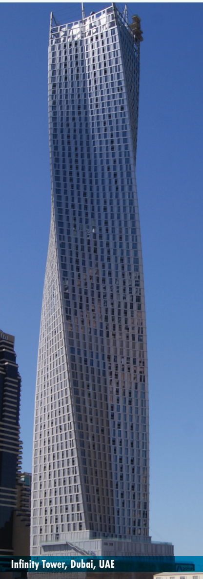
Infinity Tower, Dubai, UAE

Underlayments ■ Crack Suppression ■ Waterproofing ■ Sound Control ■ Adhesives ■ Mortars ■ Grouts ■ Sealant