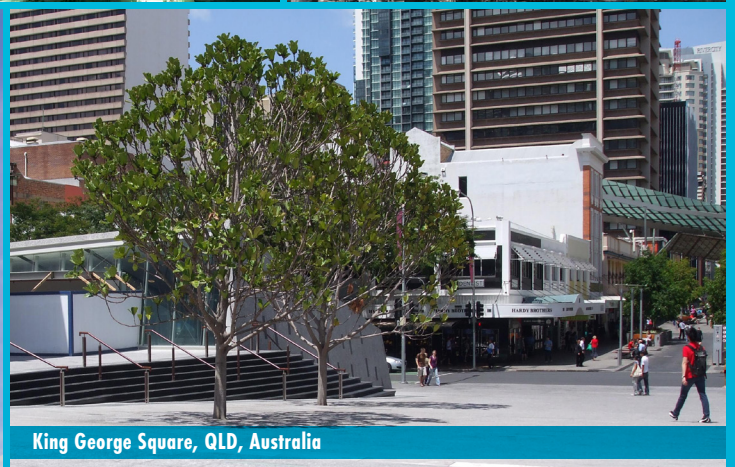
King George Square, QLD, Australia