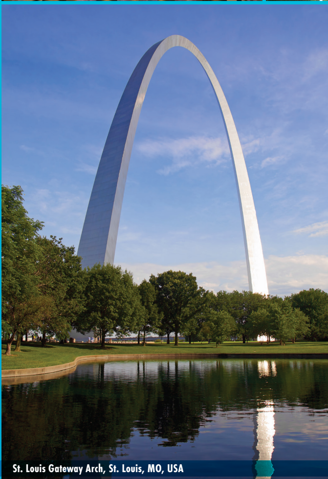
St. Louis Gateway Arch, St. Louis, MO, USA