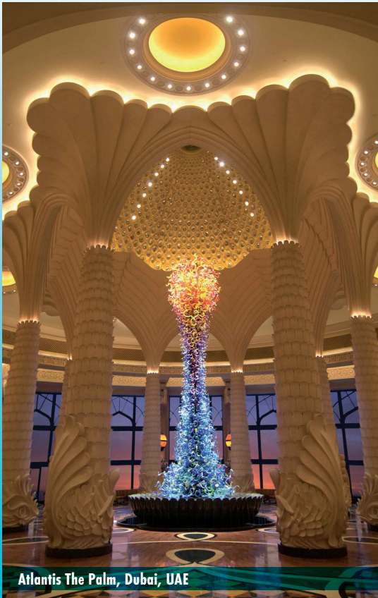
Atlantis The Palm, Dubai, UAE