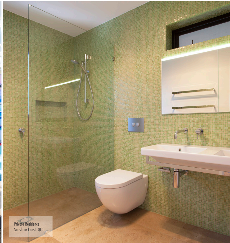
Private Residence Sunshine Coast, QLD