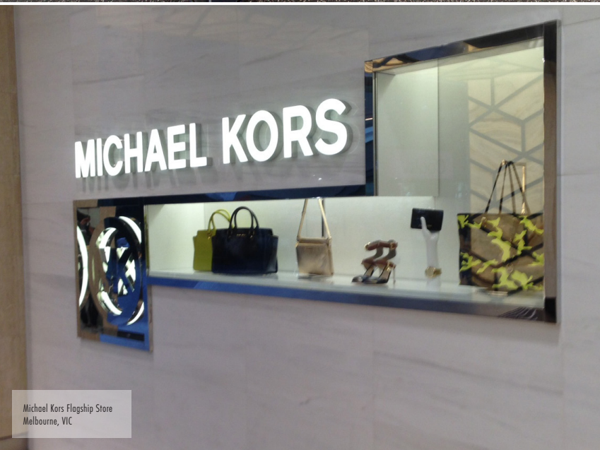
Michael Kors Flagship Store Melbourne, VIC