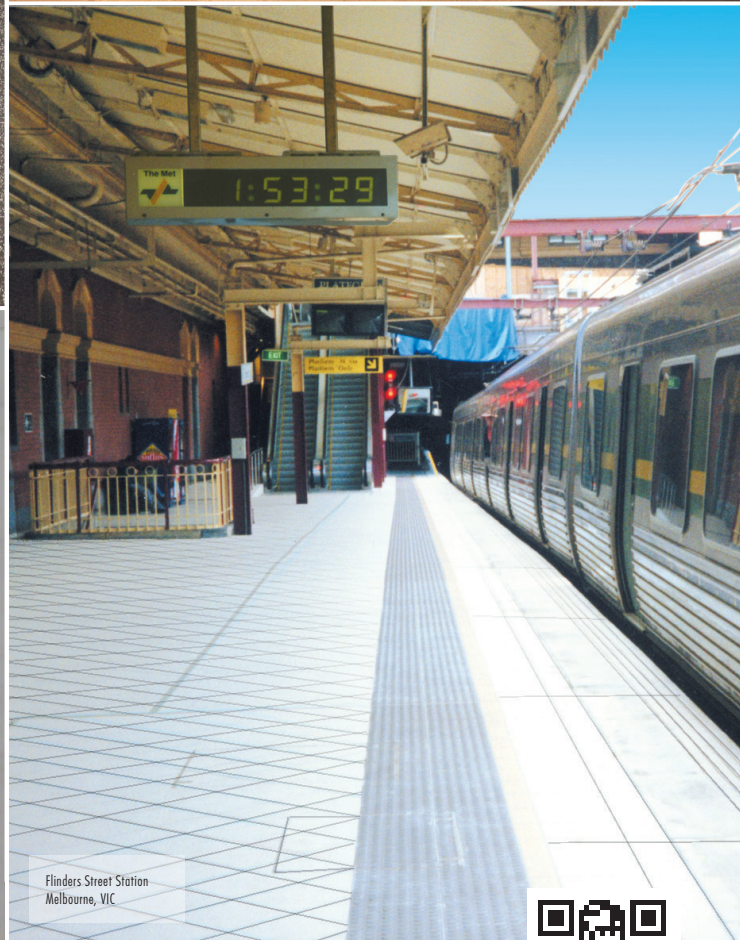
Flinders Street Station Melbourne, VIC