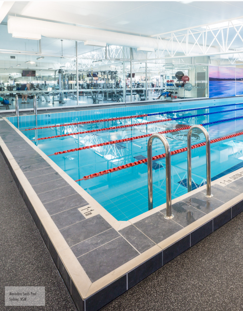
Maroubra Seals Pool Sydney, NSW