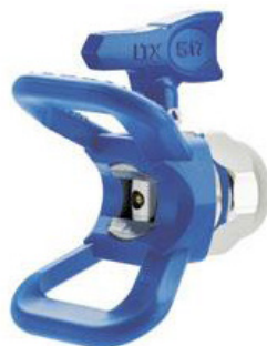
Typical LTX Sprayer Nozzle

Examples: As the orifice size increases, while maintaining the same fan width size, the greater the volume of coating will be applied to the same area. Conversely, the larger the fan width size, while maintaining the same orifice size, will result in the same amount of material being applied over a greater surface area.