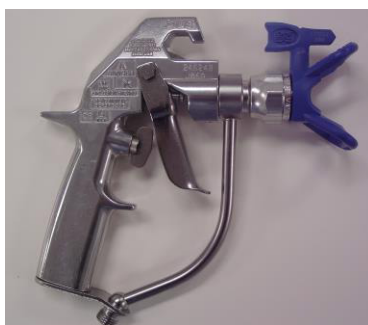
Silver Gun Plus

Follow the specific airless sprayer and spray gun manufacturer's written instructions when using their specific equipment. The Graco Silver Gun Plus® is depicted in the following photo. This spray gun can be used for both vertical and horizontal applications. Some Spray Guns will allow filtering in the gun handle. The filters will need to be periodically cleaned and changed to ensure proper liquid flow through the spray gun and tip.