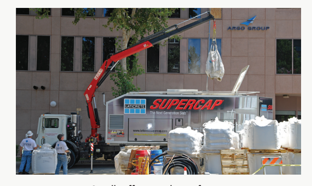
Small, efficient job site footprint, trades back to work in 24 hours