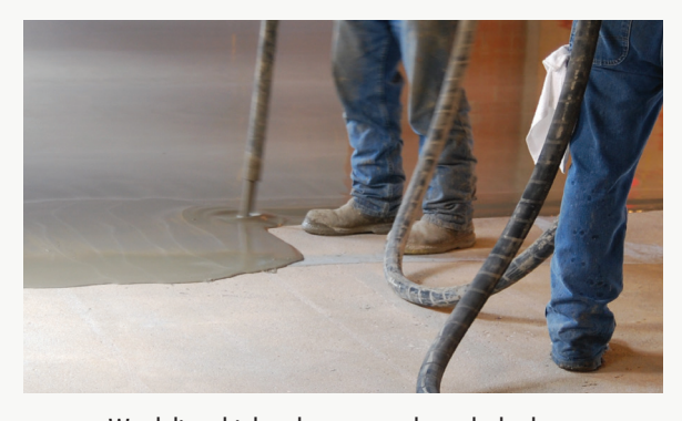
We deliver high volume, wet through the hose at equivalent of 600 bags an hour