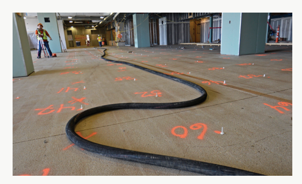
The only thing that goes in the building is a hose