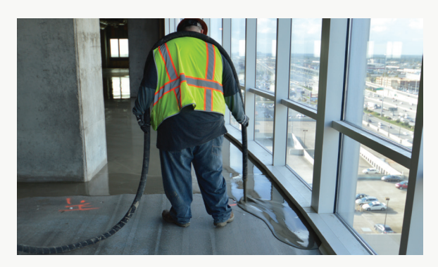
Your team handles the hoses and installs the SLU