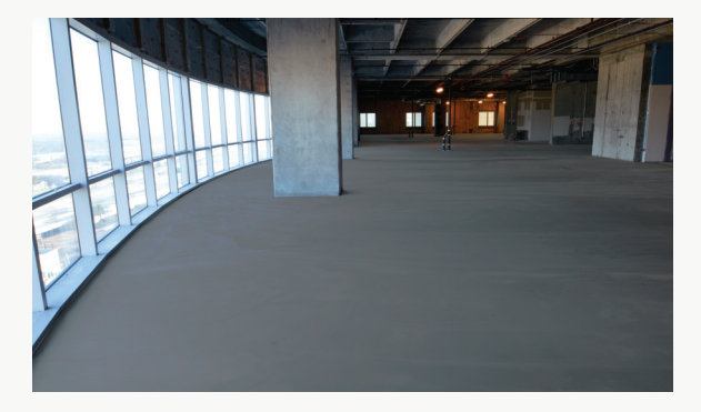
Faster back to work means faster build times, saving time on your schedule