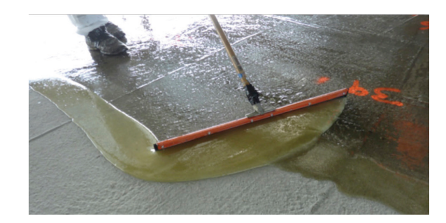
Is a single-coat, 100% solids, liquid applied 2-part epoxy coating specifically designed for controlling the moisture vapor emission rate from new or existing concrete slabs prior to installing LATICRETE® SUPERCAP® underlayments.