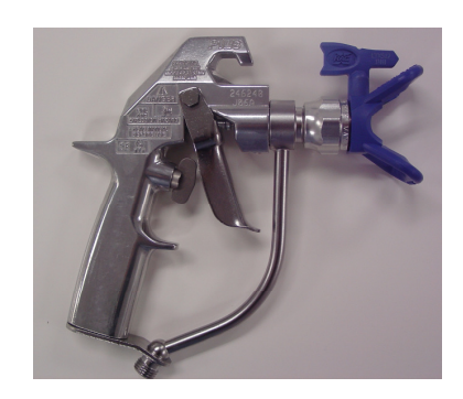
Silver Gun Plus

Follow the specific airless sprayer and spray gun manufacturer's written instructions when using their specific equipment. The Graco Silver Gun Plus<sup>®</sup> is depicted in the following photo. This spray gun can be used for both vertical and horizontal applications. Some Spray Guns will allow filtering in the gun handle. The filters will need to be periodically cleaned and changed to ensure proper liquid flow through the spray gun and tip.