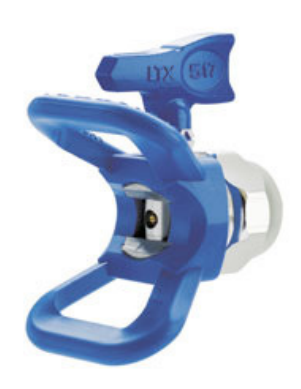
Typical LTX Sprayer Nozzle

Tip Size: LTX521 – has an orifice of 0.021" (0.5mm) and a fan width of 10" (250 mm) holding the nozzle 12" (300 mm) away from the substrate.