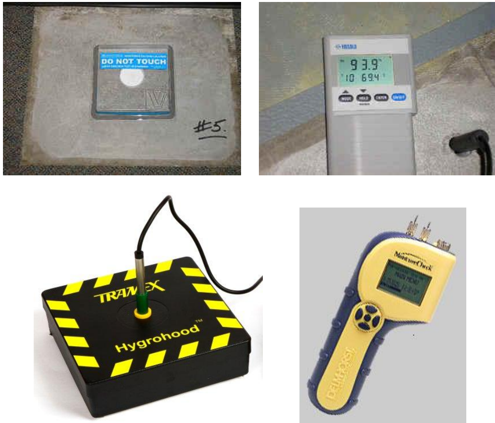
Figure 1.1 – (Clockwise from top left) ASTM F1869 Calcium Chloride Test Kit, ASTM F2170 Relative Humidity Meter, ASTM F2420 Insulated Hood with probe attached, and ASTM F2170 Pin Type Moisture Meter

Concrete contains moisture from the day it is poured and a generally accepted minimum cure time of 28 days is required before a finish material is applied. It may be important to note that 28 days is not a magic number that relates directly to every concrete installation. Simply relying on 28 days can be insufficient and can lead to failure of materials which may be affected by high moisture levels. The cure time of the concrete can vary depending on;