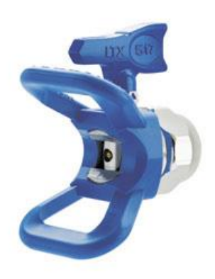
Typical LTX Sprayer Nozzle

Tip Size: LTX521 – has an orifice of 0.021" (0.5mm) and a fan width of 10" (250 mm) holding the nozzle 12" (300 mm) away from the substrate.