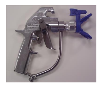
Silver Gun Plus

Follow the specific airless sprayer and spray gun manufacturer's written instructions when using their specific equipment. The Graco Silver Gun Plus<sup>®</sup> is depicted in the following photo. This spray gun can be used for both vertical and horizontal applications. Some Spray Guns will allow filtering in the gun handle. The filters will need to be periodically cleaned and changed to ensure proper liquid flow through the spray gun and tip.