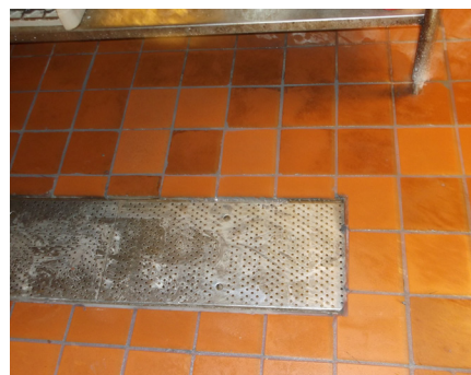
Completed floor around large floor drain.