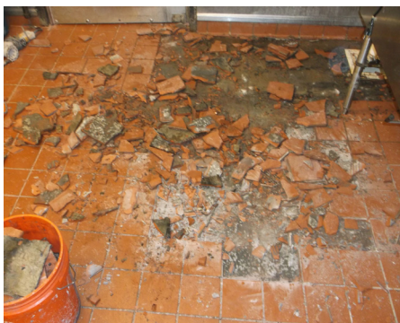
Tile removal process

LATICRETE® 254R Platinum Rapid polymer fortified thinset mortar contains Microban® antimicrobial protection.