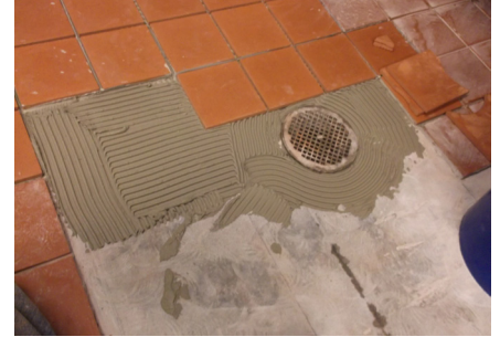
LATICRETE 254R Platinum Rapid polymer is perfect for areas around floor drains.