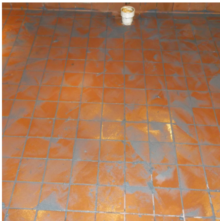
This particular job consisted of grout repair on 1,800 square feet and replacement of 500 tiles. It was finished in four days.