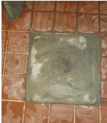
SPECTRALOCK® 2000 IG Grout is a stainproof epoxy based grout, ideal for restaurant kitchens.