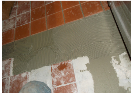
LATICRETE® 254R Platinum Rapid polymer fortified thinset mortar contains Microban® antimicrobial protection.