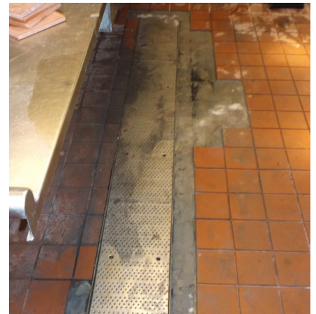
Grout applied to area around large floor drain.