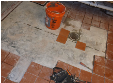
Prepping area for mortar application.

Restaurant kitchen renovations are challenging. Downtime at these active worksites can cut into profits and reduce employee hours. 1212 Flooring Solutions Inc., a family-owned nationwide flooring management service, has devised a way to totally renovate tile and grouting of a restaurant kitchen's floors without closing the restaurant.