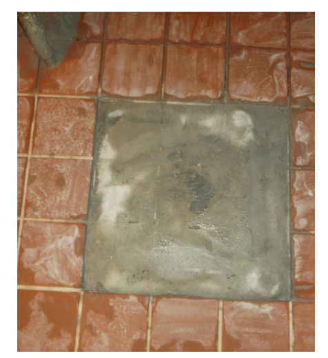
SPECTRALOCK® 2000 IG Grout is a stainproof epoxy based grout, ideal for restaurant kitchens.