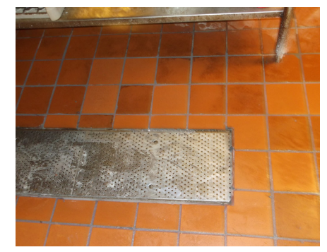
Completed floor around large floor drain.