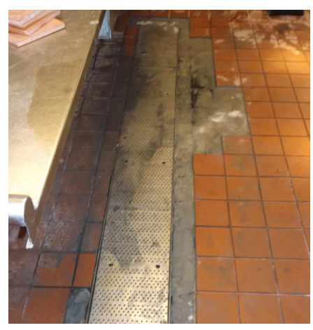
Grout applied to area around large floor drain.