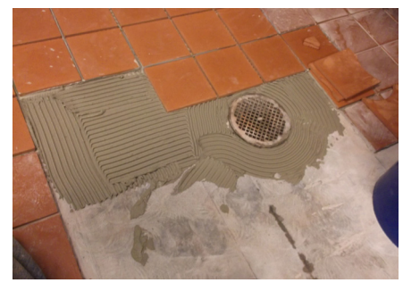
LATICRETE 254R Platinum Rapid polymer is perfect for areas around floor drains.