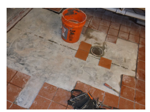
Prepping area for mortar application.