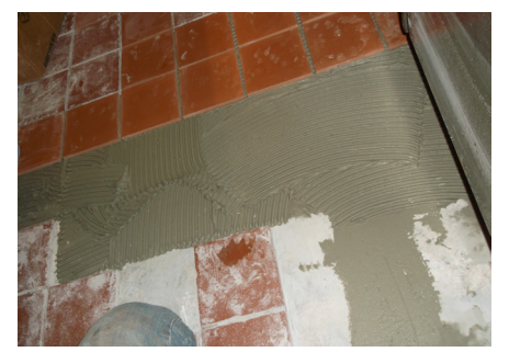
LATICRETE® 254R Platinum Rapid polymer fortified thinset mortar contains Microban® antimicrobial protection.