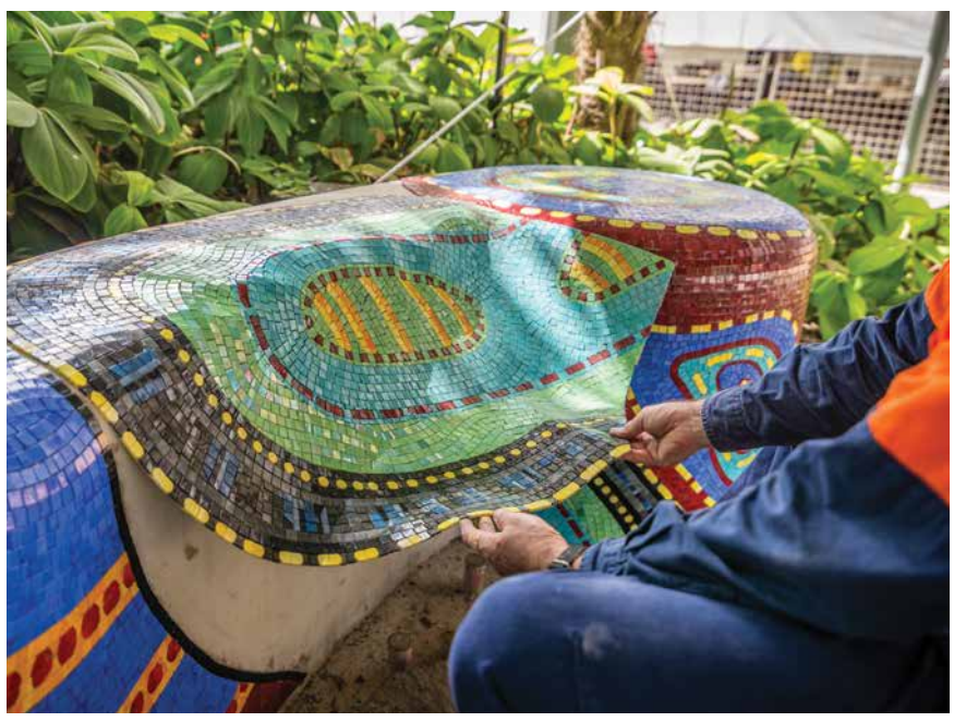
^ The Orchid Group is also known as Symmetry Mosaics