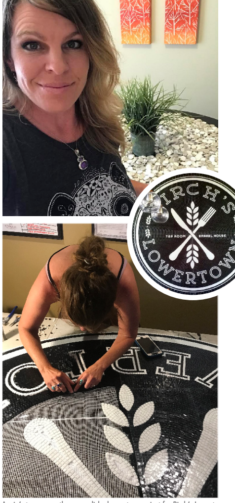
Angie's team recently accomplished a custom project for Birch's Lowerton Tap Room & Barrel House in St. Paul, Minnesota. By using the following LATICRETE® Products; 254 Platinum, SPECTRALOCK® Epoxy Grout and HYDRO BAN® Board, Unique Mosaics recreated the company's logo on a 7-foot diameter mosaic medallion using approximately 39,600 tiles.