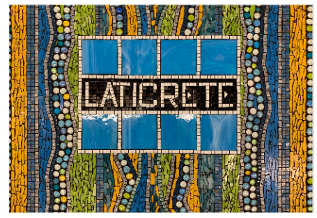
"SPECTRALOCK® 1 works especially well for my smaller projects because, as a pre-mix, I am able to close the lid back up tight and use it again later on a different project. I am impressed with how well it spreads and once cured, it keeps the tiniest of tesserae locked in."