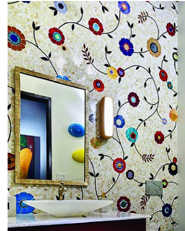
Colorful floral and vines on bone field stained glass mosaic tile in a bathroom