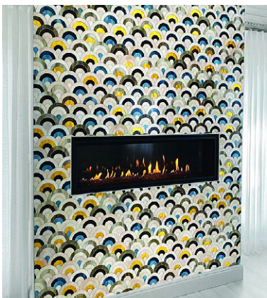
QuadScallop glass mosaic surrounding a residential fireplace