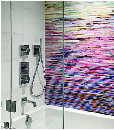
Custom glass mosaic gradation