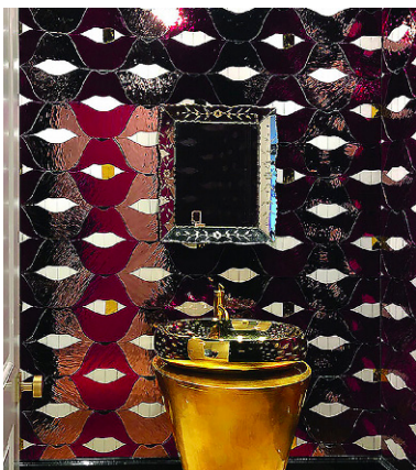
Stained glass and mirror lips powder room