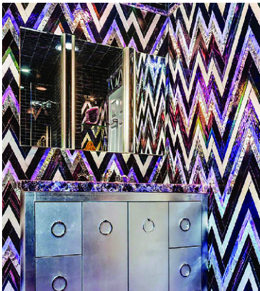
Lightning pattern in ultra violet glass and mirror mosaic tile