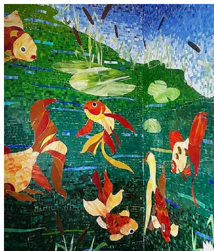
Koi fish and lily pads stained glass bathroom design by Allison Eden Studios