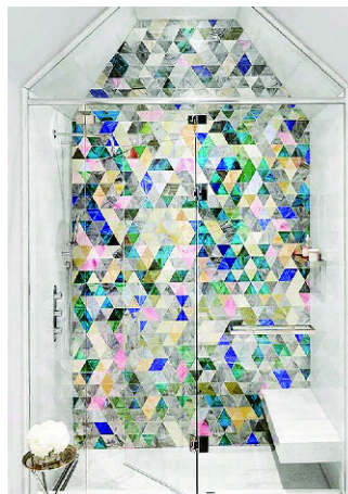
Impressionist triangles with stained glass mosaic tile in a residential bathroom shower for interior design